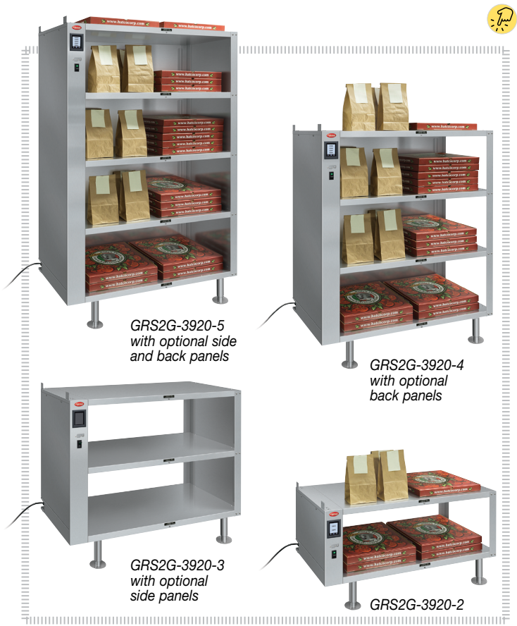
GRS2G-3920-5 with optional side and back panels